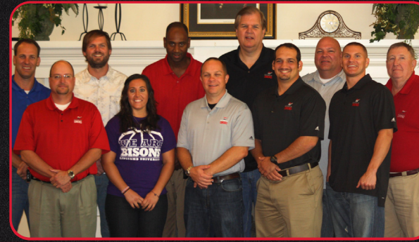
NOC's first Character Coach Training event in 2011

Nations of Coaches began serving coaches through Bible studies at AAU events, the NABC Convention, and weekly conference calls. God miraculously began to open doors allowing NOC to build trusted relationships and connect coaches with other like-minded people in the industry.