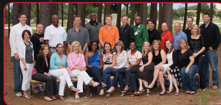
NOC's first marriage retreat in 2009