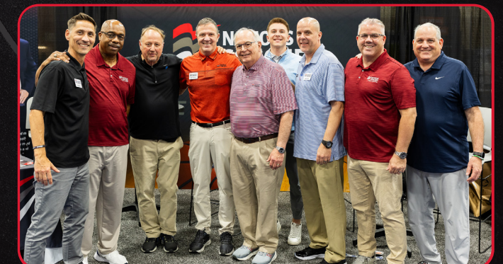
NOC Regional Director Staff at the NABC Conference in 2024