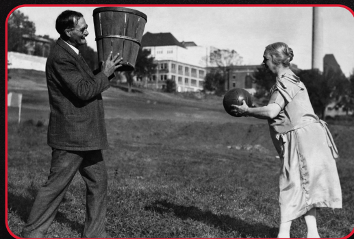
Dr. James Naismith, the inventor of basketball, practicing with his wife

Nations of Coaches had regional staff strategically serving 16 states across the country, reaching one third of the 1,964 collegiate men's basketball programs.